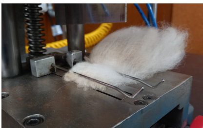
Pneumatic Guillotine (Figure 1)

The OFDA100 (Figure 3), an optical based instrument, produces results for mean fibre diameter (fibre thickness), curvature (similar to fibre crimp) and medullation (the number of hollow fibres). Technical information on these measurement characteristics can be found in our information bulletins: OFDA100, Mean Fibre Diameter, Fibre Curvature, Medullation . The OFDA100 data or MES file is uploaded into the reporting system which automatically manages the data to produce the reportable outcomes and the fibre diameter distribution histogram OFDA100 Histogram Definition .