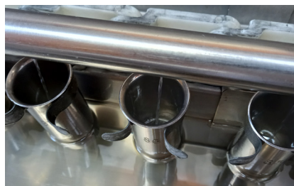
Solvent Scour (Figure 2)