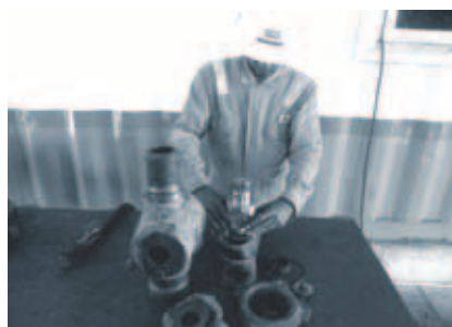
Inspection for worn out parts