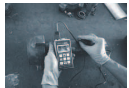
Ultrasonic Wall Thickness readings being taken on various DME parts