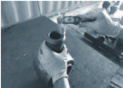
Dimensional Measurements to ensure wear is not below Minimum Dimensions

To compliment the ultrasonic wall thickness readings, dimensional measurements are taken on areas of the equipment that are susceptible to wear. Minimum dimensions are provided by our customer and/or equipment manufacturer to ensure against wear that will increase probability of failure.