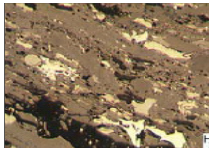
Coal Particle in reflected light (500x)

Email us at minerals@sgs.com www.sgs.com/mining