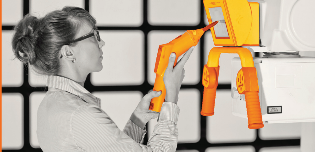
EMC Chamber ESD testing of an X-ray System.

Our SGS Labs in Germany offer a range of services including: