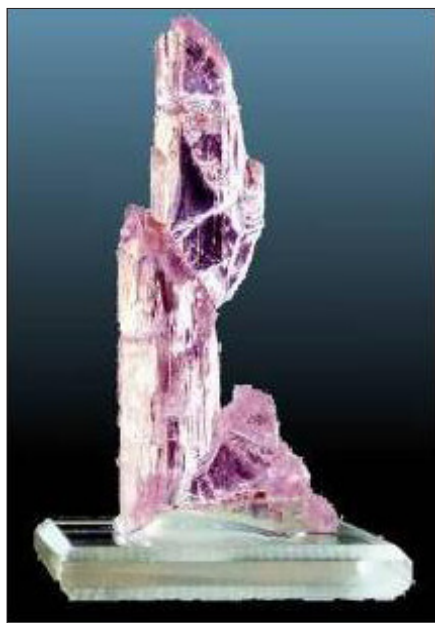
Spodumene, Galileia, Brazil