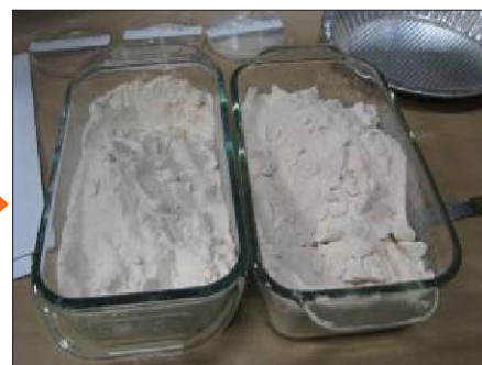
After Acid Roasted Concentrate