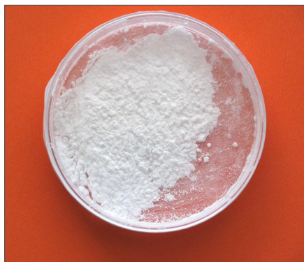
A sample of high grade lithium carbonate